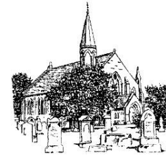
Oathlaw Tannadice Parish Church