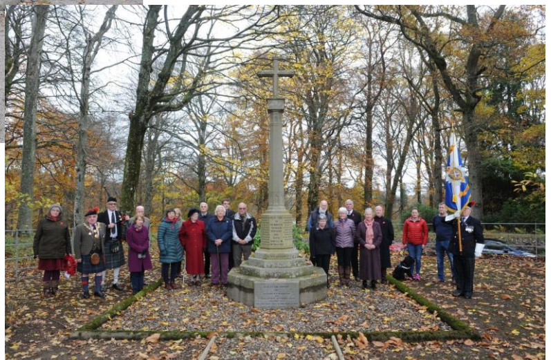
Cortachy War Memorial