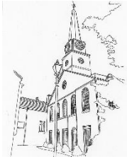
Kirriemuir Parish Church