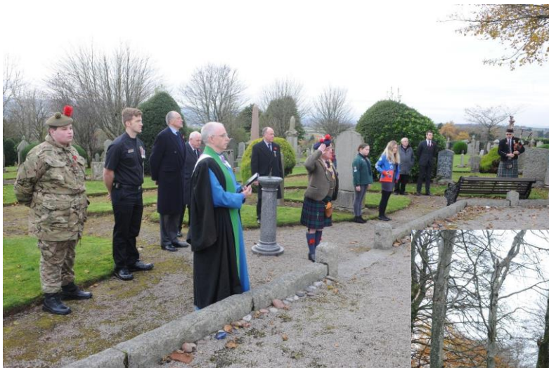
Kirriemuir War Memorial

Unlike last year, we were able to gather as a community to mark Remembrance Sunday. There was a great turnout at churches and war memorials across the area to mark the sacrifice of those who have died and suffered in past conflicts.