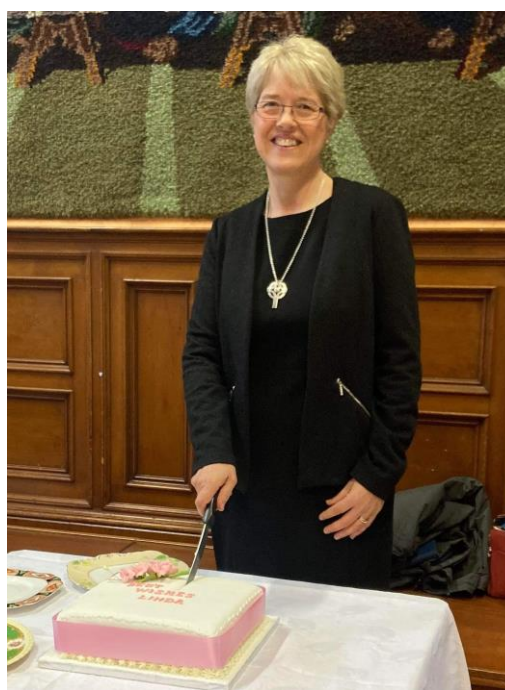
Photographs from Cortachy Church and Parish Church

Faithful God, bless those who serve and have served; bless those who find new ways to serve and those who pick up new responsibilities. May our life find fulfilment in the doing of the work you call us to. Amen